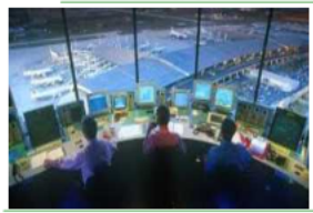
Quality Control Measurements