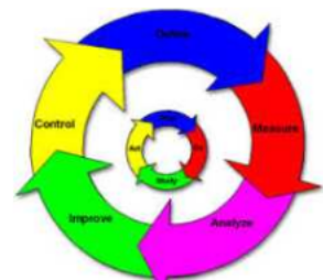
Quality Management Plan (8.1)