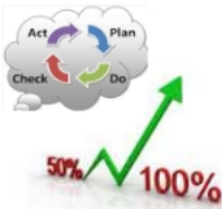
Process Improvement Plan (8.1)