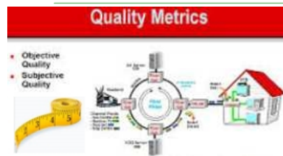
Quality Metrics (8.1)