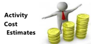
Activity Cost Estimates