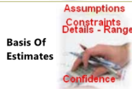
Basis Of Estimates