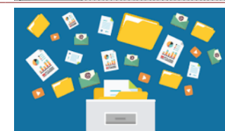
Existing BA Information